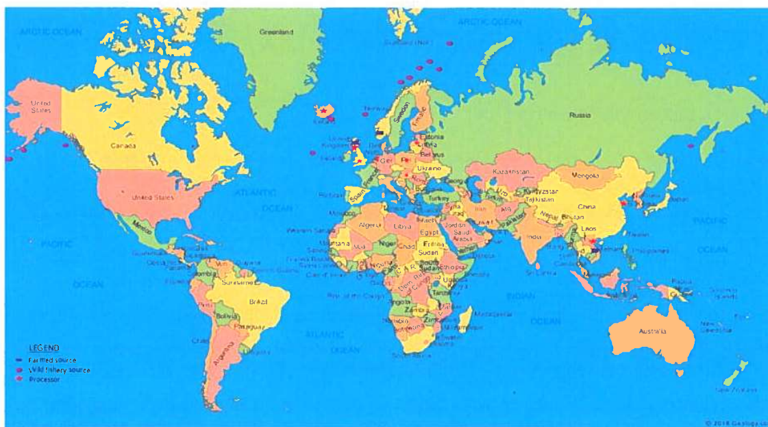
Map 1 – Global Supply Chain

The map below shows where in the world we source our products from –